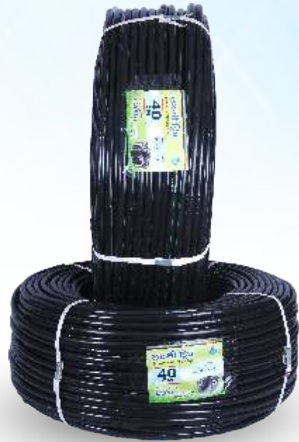
INLINE / ONLINE LATERAL