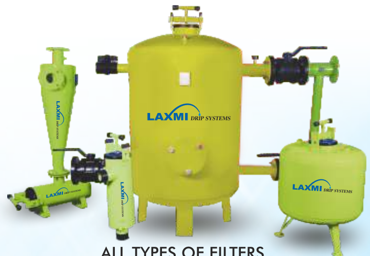
ALL TYPES OF FILTERS